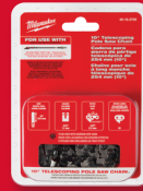
M18 FUEL™ 10" Telescoping Pole Saw Chain 49-16-2759