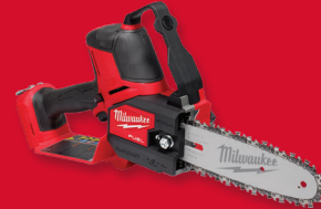
M18 FUEL™ HATCHET™ 8" Pruning Saw (Tool-Only) 3004-20