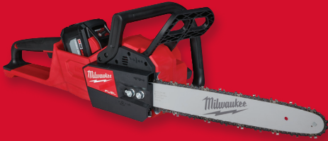
M18 FUEL™ 16" Chainsaw Kit 2727-21HD