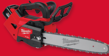
M18 FUEL™ 14" Top Handle Chainsaw Kit 2826-21T